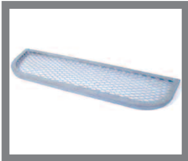
Optional: Metal Grating Cover