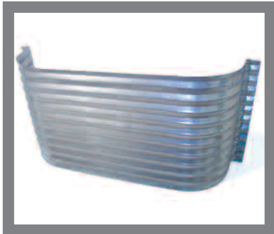
Standard: Window Well