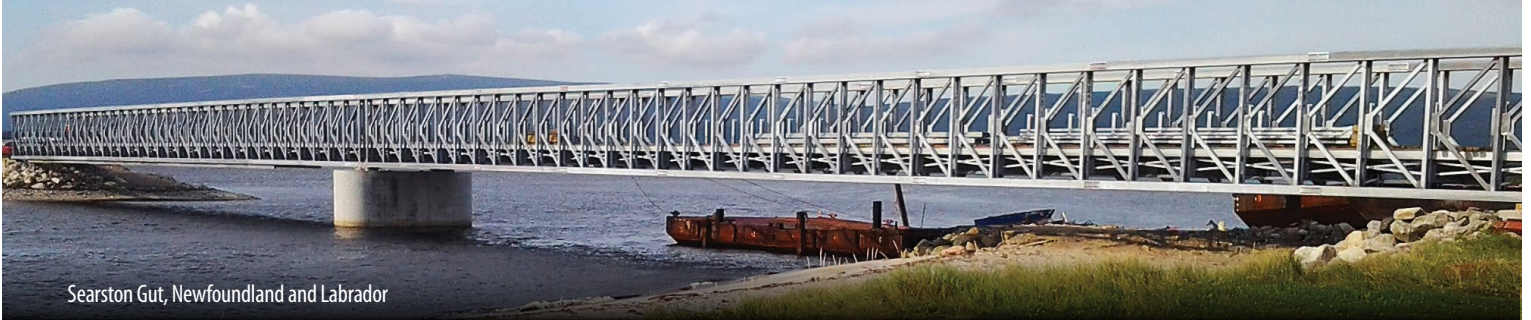
Searston Gut, Newfoundland and Labrador