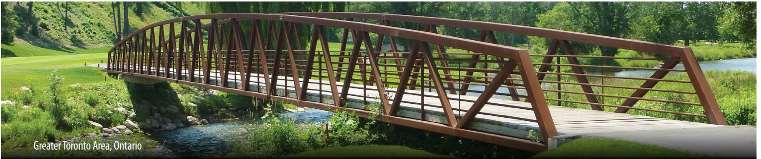
Greater Toronto Area, Ontario