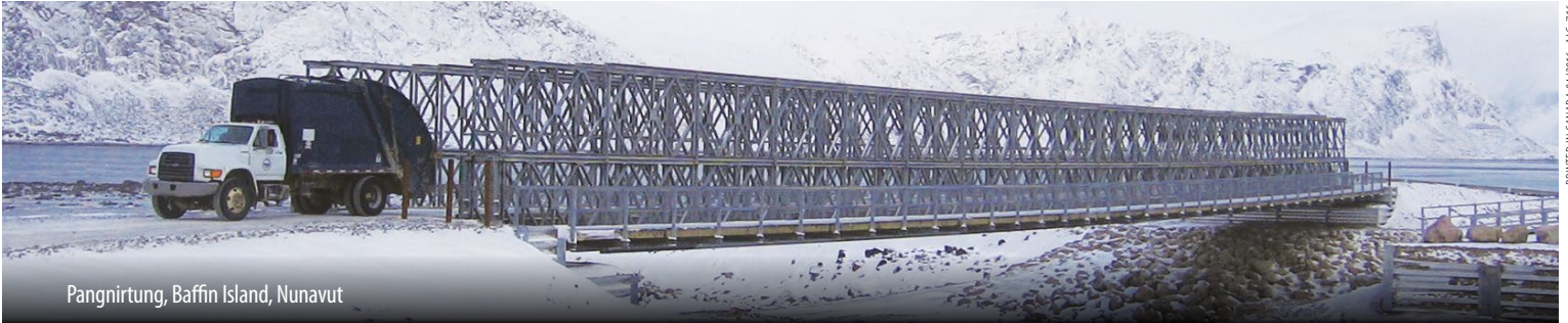
Pangnirtung, Baffin Island, Nunavut