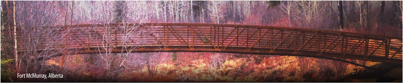
Fort McMurray, Alberta