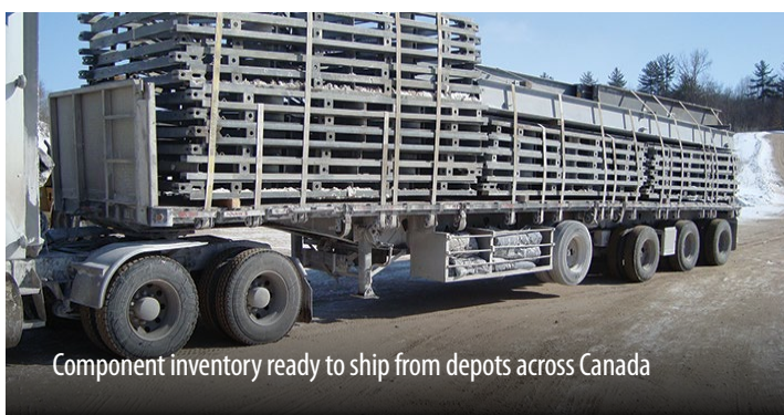
Component inventory ready to ship from depots across Canada