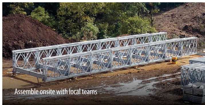
Assemble onsite with local teams