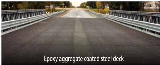
Epoxy aggregate coated steel deck

Available for sale or rental, our Mabey Bridge components are ready to ship quickly to any location in Canada.