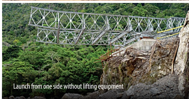
Launch from one side without lifting equipment