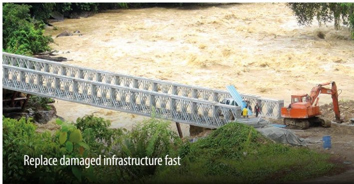
Replace damaged infrastructure fast

As Canada's go-to emergency bridging specialist, Algonquin Bridge is ready to respond with available inventories of Mabey Modular Panel Bridge Systems, in-house engineering teams and reliable field service. We are your single source to fast track a wide variety of permanent or temporary structures for sale or rent. Our pre-engineered Mabey Bridges are ideally suited to the fast replacement of damaged infrastructure and have been proven many times in emergency situations worldwide.