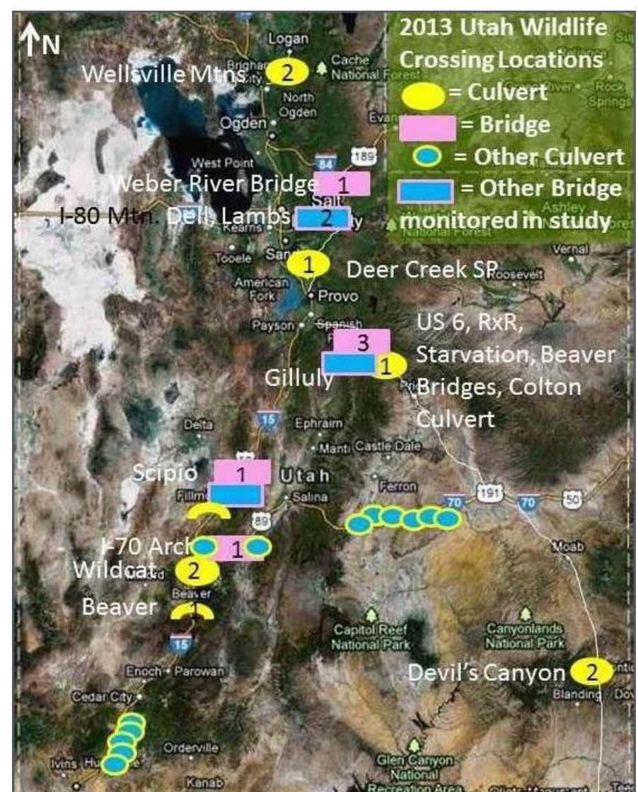
FIGURE 1. Wildlife crossing bridges, culvert, and overpass and existing structures monitored in this study.