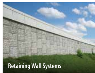
Retaining Wall Systems