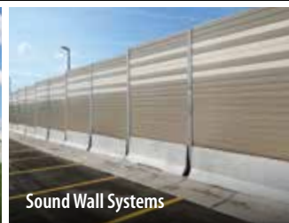
Sound Wall Systems