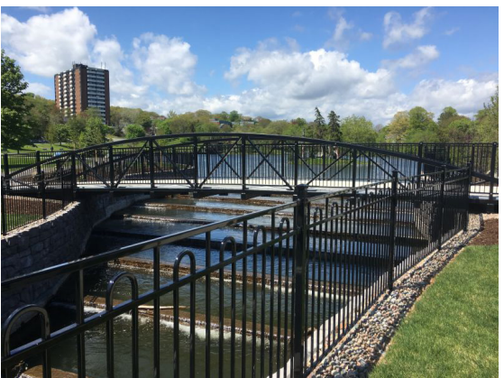
See all Project Profiles on ail.ca