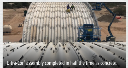
Ultra•Cor® assembly completed in half the time as concrete.