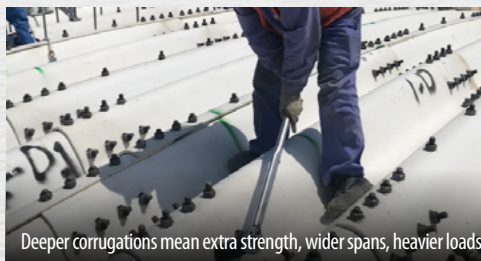
Deeper corrugations mean extra strength, wider spans, heavier loads.