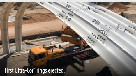
First Ultra•Cor® rings erected.