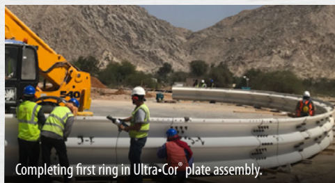
Completing first ring in Ultra•Cor® plate assembly.