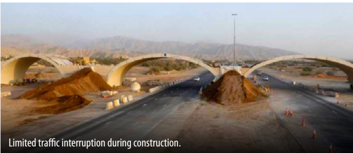
Limited traffic interruption during construction.

Available in a variety of Arch geometries as well as Box Culverts, Ultra•Cor® is appealing to DOTs as an economical alternative to short-to-medium span bridges, tunnels, underpasses and river crossings. Mining companies specify it for larger haul road crossings, stockpile tunnels, portals and canopies. Ultra•Cor® is manufactured in accordance with CHBDC, AASHTO, ASTM and AREMA design requirements.