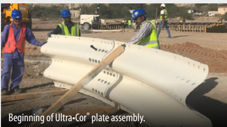
Beginning of Ultra•Cor® plate assembly.