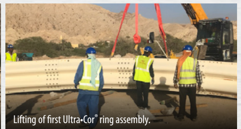
Lifting of first Ultra•Cor® ring assembly.