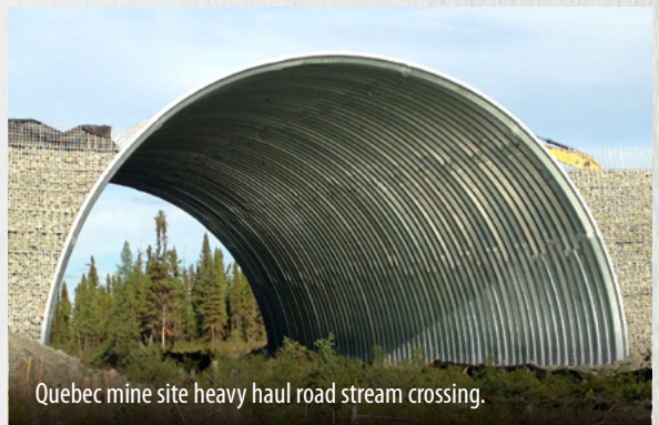
Quebec mine site heavy haul road stream crossing.