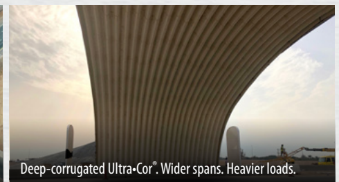
Deep-corrugated Ultra•Cor®. Wider spans. Heavier loads.