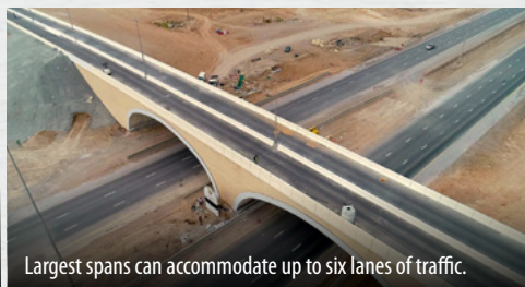
Largest spans can accommodate up to six lanes of traffic.