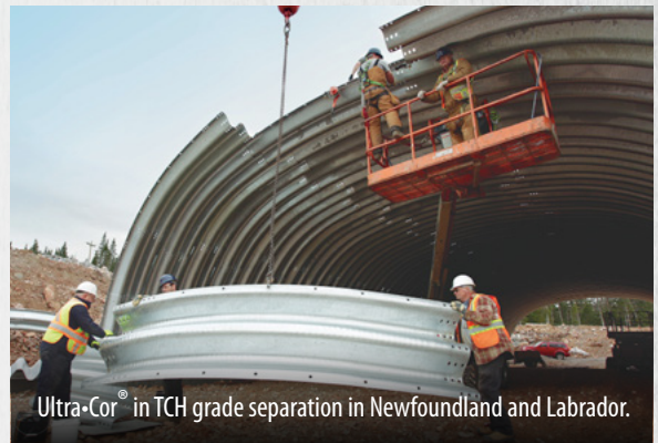
Ultra-Cor® in TCH grade separation in Newfoundland and Labrador.