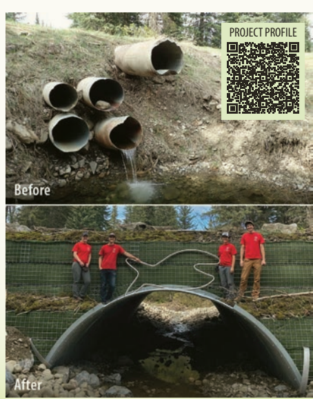
An AIL Geotextile Reinforced Soil (GRS) Bridge replaces suspended culverts and restores fish passage on an Alberta creek.