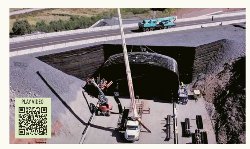
Keeping traffic running: Staged construction with temporary MSE walls enable continuous traffic flow throughout construction.