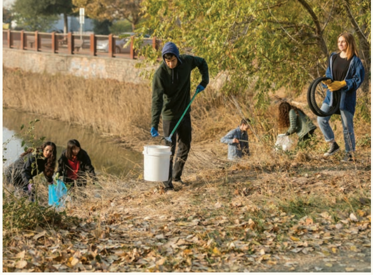
Supporting our communities: We are proud to support our local communities in a variety of ways.