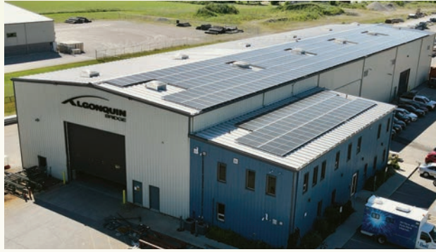
Over 1,000 solar panels and counting: Our on-site renewable energy production decreases our reliance on the power grid.