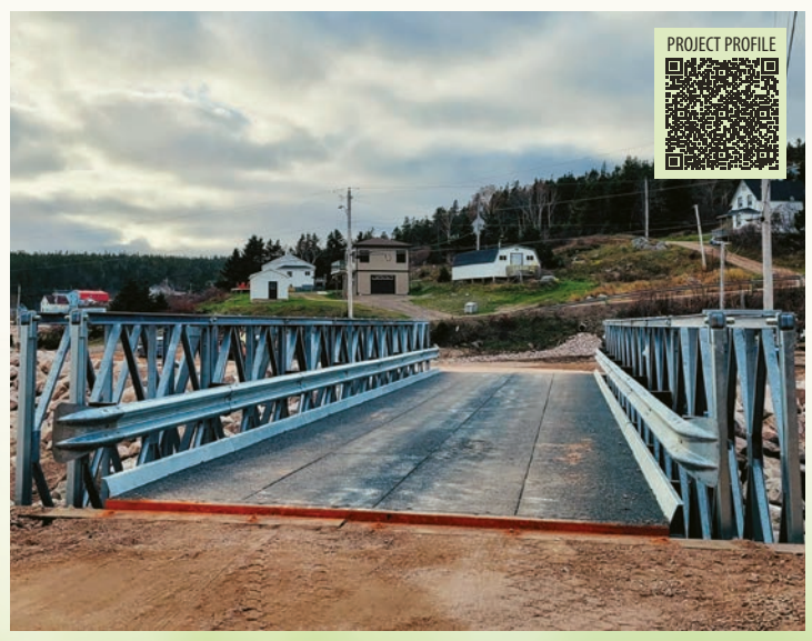
Emergency solution: This replacement bridge was delivered to a remote site in Nova Scotia within five days of order.