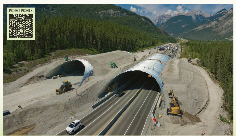
Supporting wildlife connectivity: The Bow Valley Gap Wildlife Overpass is expected to increase wildlife connectivity in the Yellowstone-to-Yukon corridor and dramatically reduce wildlife-vehicle collisions.